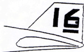
PLACEMENT ON STRAIGHT TAIL

NUMBER LOCATIONS: ON BOTH SIDES OF WINGS AND TAIL. THAT IS A TOTAL OF FOUR LOCATIONS