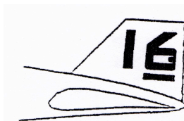
PLACEMENT ON STRAIGHT TAIL